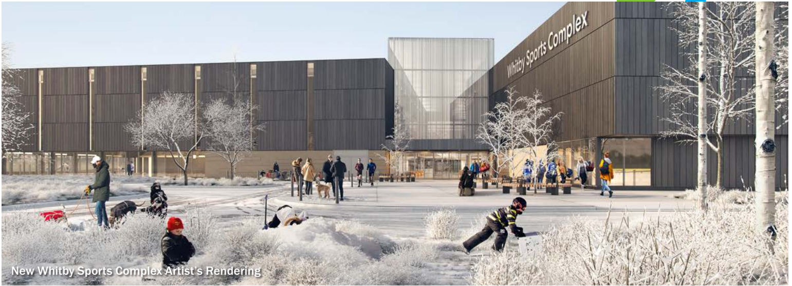
New Whitby Sports Complex Artist's Rendering