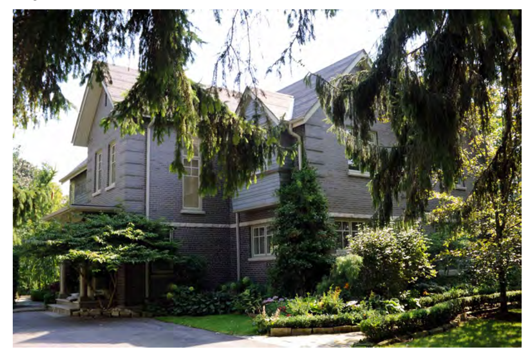
Classification Complementary (Exemplary)