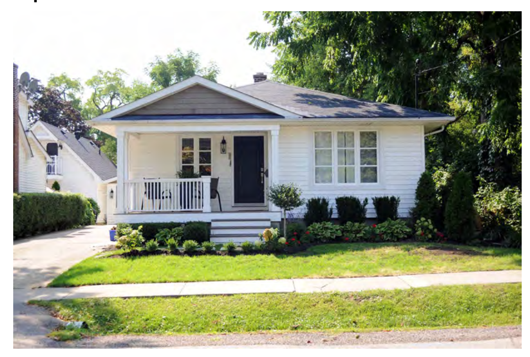
Classification Complementary (Exemplary)