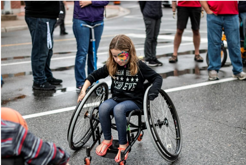
Participating with ParaSport Ontario Basketball