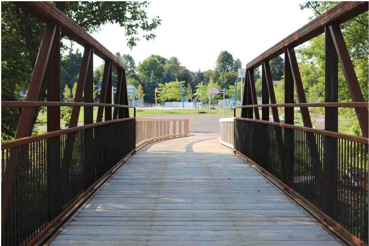
Bridge connecting White Oaks neighbourhood to Jeffery Park