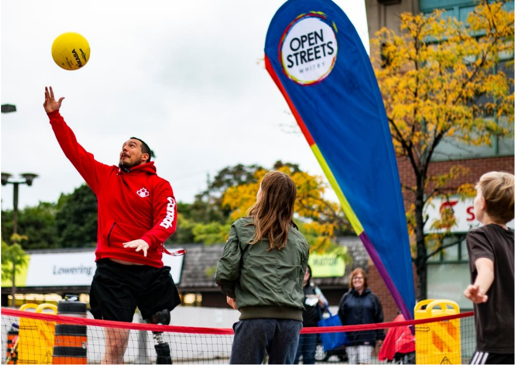
Participants at Whitby's Open Streets Event

The Accessibility for Ontarians with Disabilities Act (AODA) is a law that sets out a process for developing and enforcing accessibility standards. Accessibility Standards Regulations are laws that government, businesses, non-profits and public sector organizations must follow to become more accessible.