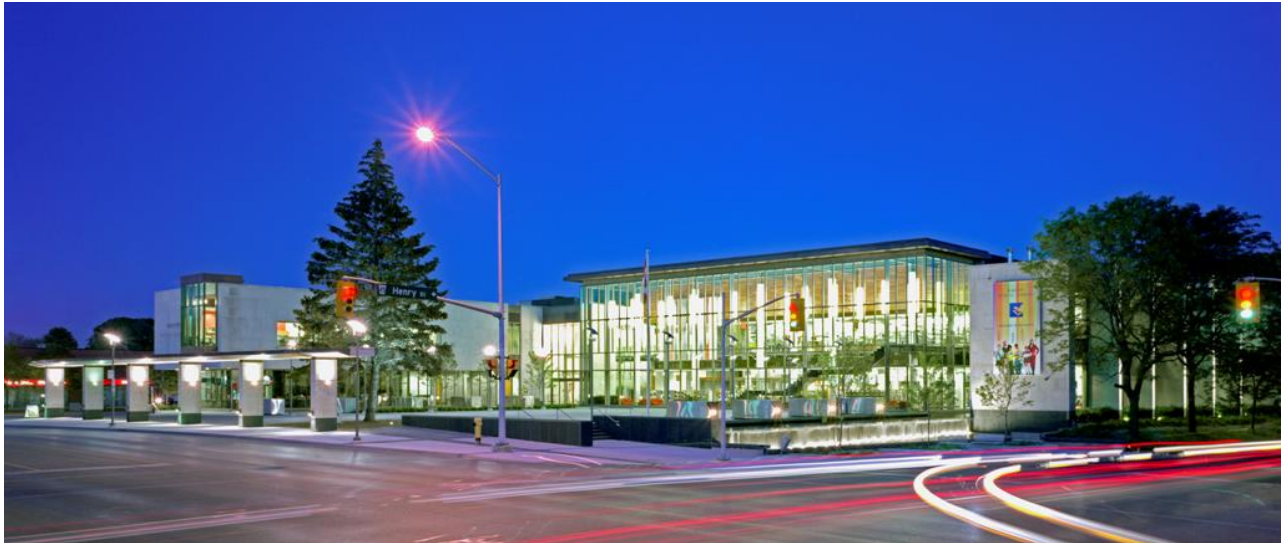
Whitby Public Library - Central Branch