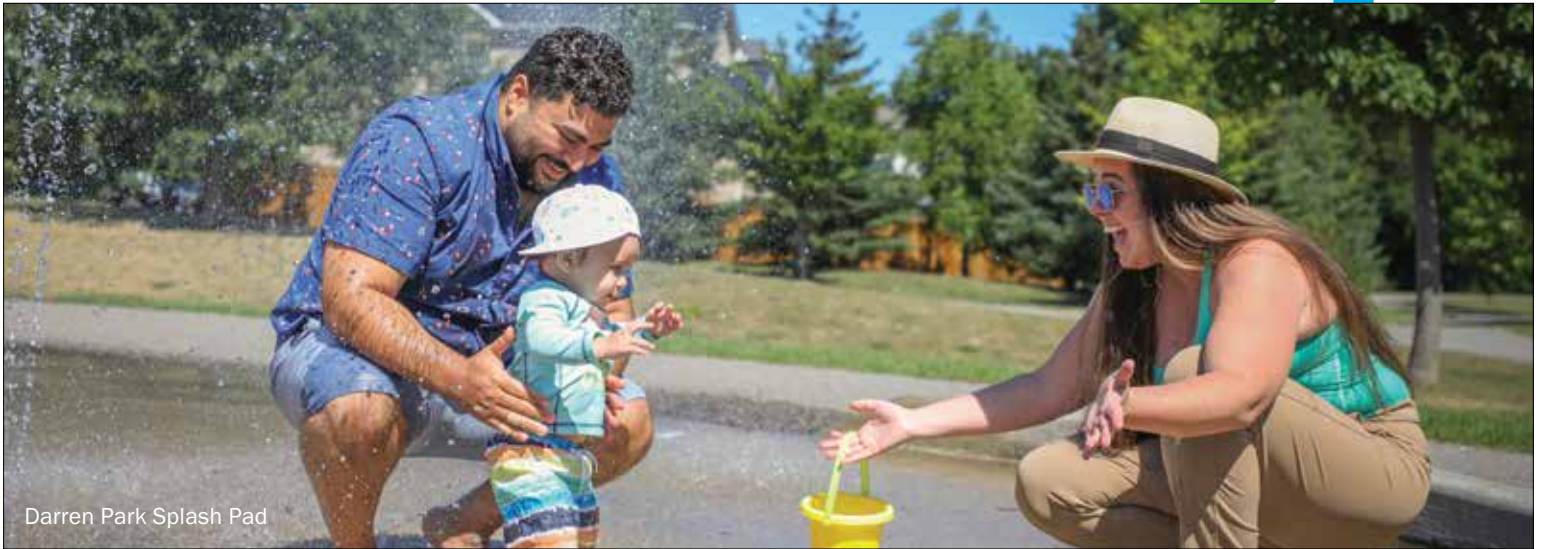
Darren Park Splash Pad